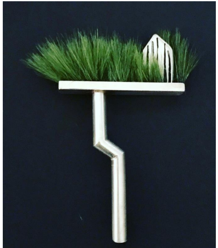
South Pass City 2018, Sterling silver, faux grass, steel, acrylic, resin

I made a Brooch called South Pass City, with 14 solder seems and faux grass. On the 14th solder seem I tried and tried to solder the pin back on & the whole thing kept coming apart. I eventually hired Deb Miller to laser weld the pin back on. I felt like I met my match on that one. It was in a show in Milwaukee and went to SNAG in 2019. It's about a ghost mining town in Wyoming with a population of 1.5 near where I grew up.